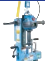
Control Integrations Gorbel G Force Hand Control Pendant Control Pneumatic Gripper Retraction