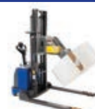
Heavy Duty Roll Lifter/Turner to 2200 lbs. (1000 kg) Low or High Lift Any Core / Roll Diameter / Width