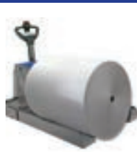
Fully Powered V Cradle Roll Movers to 11000 lbs. (5000 kg) Heavy Duty Battery Powered Any Roll Diameter / Width