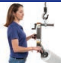
MRT-100 Manual Roll Turner 100 lbs. (45 kg) Any Core Size