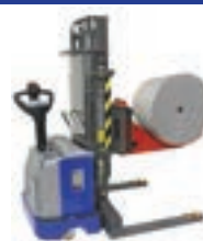
Heavy Duty Roll Loaders to 2200 lbs. (1000 kg) Hydraulic Tilting Cradle Any Roll Diameters / Widths