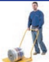
V Cradle Roll Dollies to 2200 lbs. (1000 kg) Heavy Steel Construction Any Roll Diameter / Width