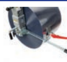
Anti-Telescoping Attachments Mechanical, Pneumatic & Hydraulic Prevents outer wraps from falling when roll is lifted or turned.