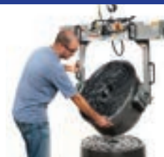
VODC-330 Pneumatic OD Clamp Lifter/Turner 330 lbs. (150 kg) Any Roll Diameters & Widths