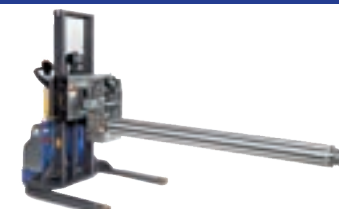
Heavy Duty Shaft Handler Lifts, inserts and extracts heavy expanding shafts, improving productivity and completely eliminating the risk of both equipment damage and operator injury.