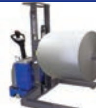
Heavy Duty Roll Probe Handlers to 2200 lbs. (1000 kg) Low or High Lift Any Core / Roll Diameter / Width