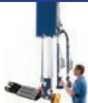
Crane Based Manipulators Lift, Turn, Load & Unload to 1000 lbs. (450 kg) Any Roll Diameter / Narrow