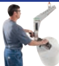
MRT-330-AL-ADJ Manual Roll Turner 330 lbs. (150 kg) Any Core Size