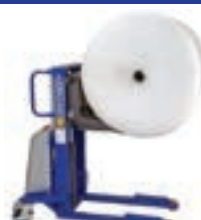
Cradle Roll Loader/Unloader to 2200 lbs. (1000 kg) Battery Powered Hydraulic Lift Any Roll Diameter / Width