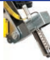
Remote Mandrel Gripper Retraction Systems Allows operator to stand behind machine to load and unload rolls. Electro-pneumatic or Manual Cable