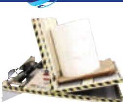
HRUP Hydraulic Roll Upenders to 5000 lbs. (2267 kg) Flat, V Cradle or Roller Tops, Roll Centering Pusher Any Roll Diameter / Width