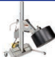
ERH-400 Roll Lifter/Turner to 400 lbs. (186 kg) Battery Powered Lift & Turn Any Roll Diameter / Width