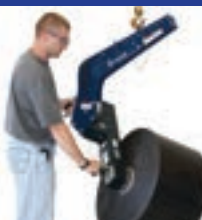
MRT-500-AL-ADJ Manual Roll Turner 500 lbs. (226 kg) Any Core Size