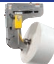
HRT-2200-EL Powered Leveling Electro-Hydraulic Roll Turner 2200 lbs. (1000 kg) Any Core Size