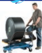
HRC Roll Cradle Carts to 1100 lbs. (500 kg) 0°, 90° & Swivel Tops Any Roll Diameter / Width