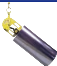
VRL-500-TA, VLR-1000-TA Roll Tilters 500 lbs. (226 kg) and 1000 lbs. (450 kg) Any Core Size