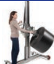
Manual Roll Lifter/Turner to 500 lbs. (226 kg) Any Roll Diameter Narrow Widths Only