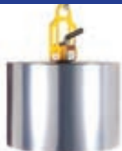
VRL-2200 Center Lifter 2000 lbs. (900 kg) Any Core Size