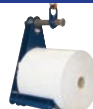
HRL-1000 Roll Cradle Lifter 500 lbs. (226 kg) Any Roll Diameter Width