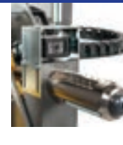
Vision Systems Allows operator to view work area for precise positioning.