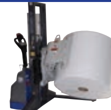
Heavy Duty Clamp Lifter/ Turner to 4400 lbs. (2000 kg) Low or High Lift Any Roll Diameter / Width